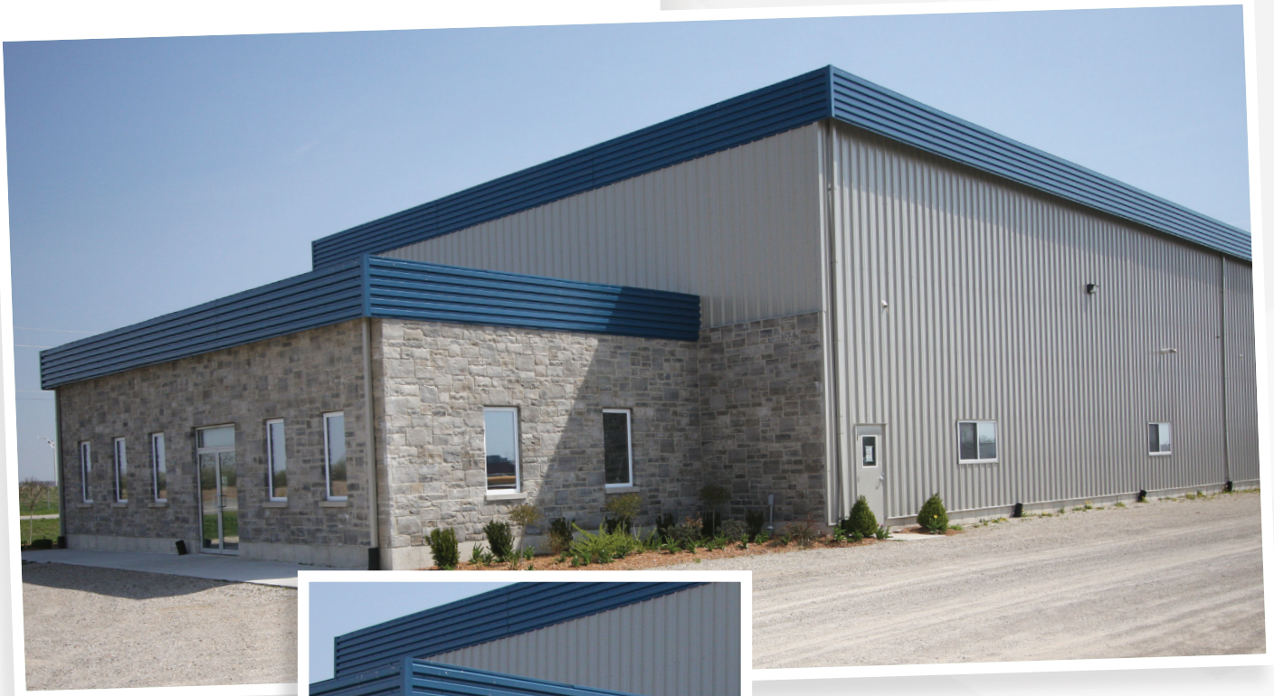
The Heron Blue StrucSeal parapet band creates an attractive accent on this Stone Grey StormSeal building.